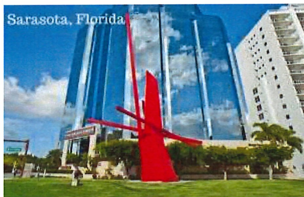
Sarasota Office for Blalock Walters