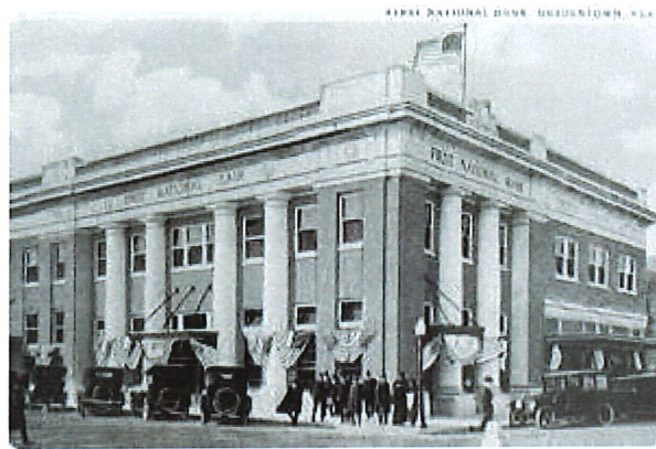
First national bank with cars.

Our attorneys have held leadership positions of their professional associations serving as Presidents or Chairs of the Manatee County Bar Association; The Florida Bar Grievance Committee; the Twelfth Circuit Judicial Nominating Commission; the Manatee County Estate Planning Council; Florida Planning and Zoning Association; City, County and Local