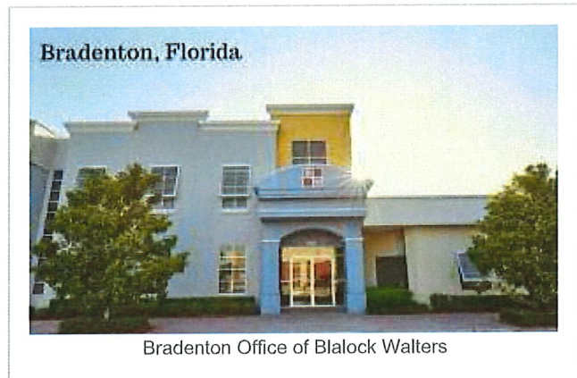
Bradenton Office of Blalock Walters

We are very proud of the Firm's historical commitment to the community, its residents, and to the solution of its clients' legal matters. We remain committed to continuing this legacy as we move forward.