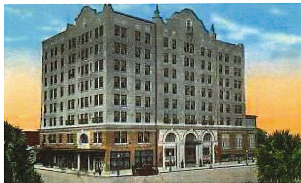
Dixie Grand Hotel